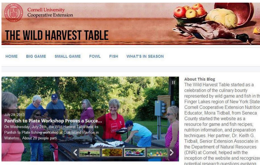
Fig. 3. Representation of the homepage of the Wild Harvest Table website.

Seneca County is nestled in the Finger Lakes between Seneca and Cayuga Lakes in upstate New York. The mixed hardwood and agricultural landscapes in proximity to such large and clean lakes and their tributaries makes for a unique and bountiful fish and wildlife situation. Situated in the Atlantic Flyway, Seneca County boasts impressive numbers of migratory waterfowl, including many species of ducks, Canada geese, and snow geese. The county is predominately agricultural, which provides for a healthy white-tailed deer population and small mammals, and increasingly, larger